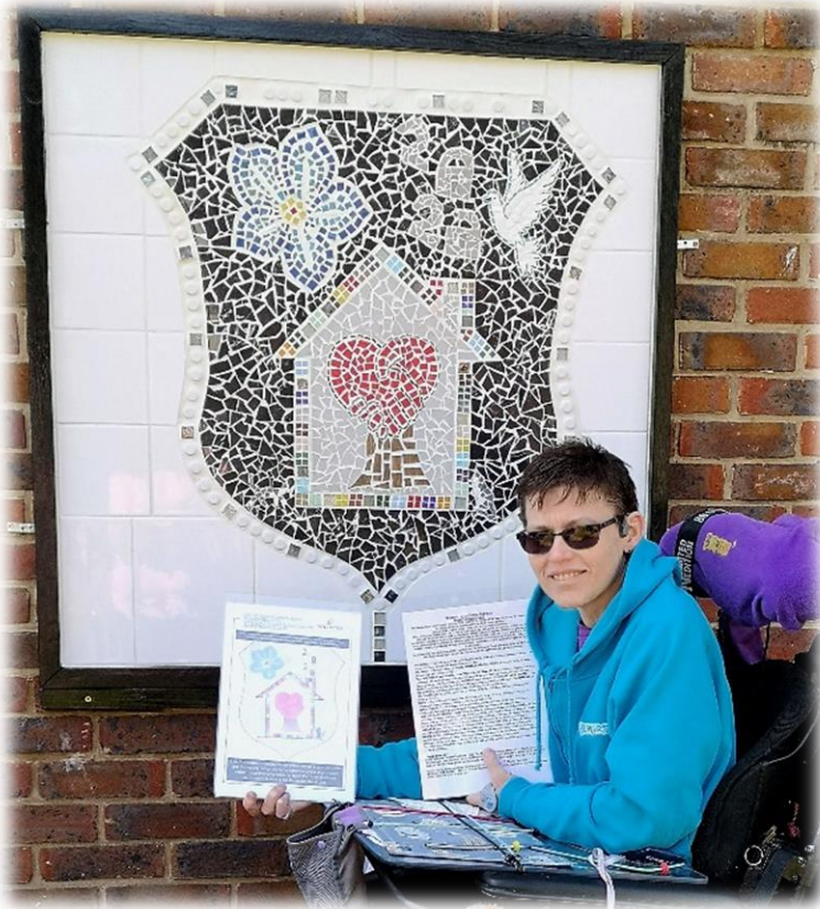
Below left is the finished mosaic which is on the wall in the garden of the home.

The drawing on the below right was entered into the competition and won.